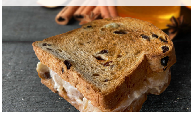
APPLE PIE PANINI $3.5

HONEY WHIPPED CREAM CHEESE | CINNAMON BROWN SUGAR APPLE SLICES | RAISIN BREAD