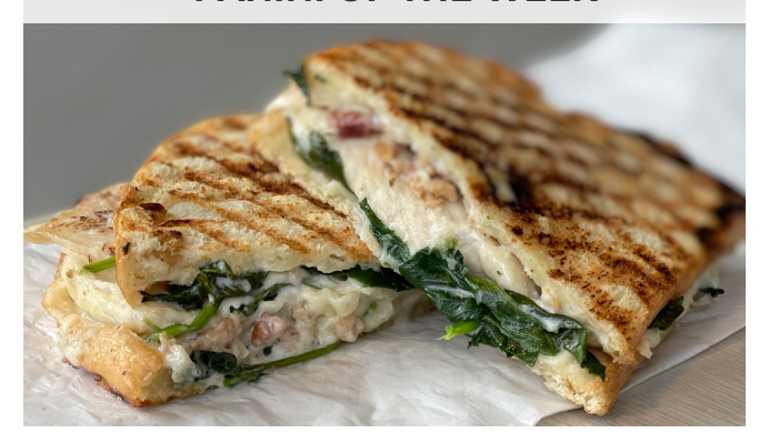
CHICKEN BACON RANCH $5.25

GRILLED CHICKEN BREAST | BACON PROVOLONE | RANCH | SPINACH